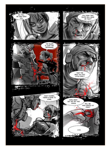
Fig. 4 Woodcut Illustration from DNA Hacker Chronicles Issue 3.1 Kohse sketched and hand painted for mass production