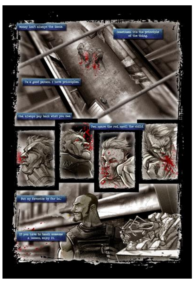
Fig.5—The DNA Hacker Chronicles Issue 3.13 &14